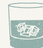
The Last Word